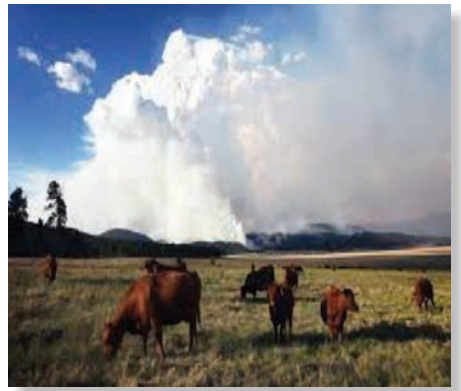
Moving livestock to previously grazed areas will help protect them against an advancing wildland fire by acting as a defensible space.